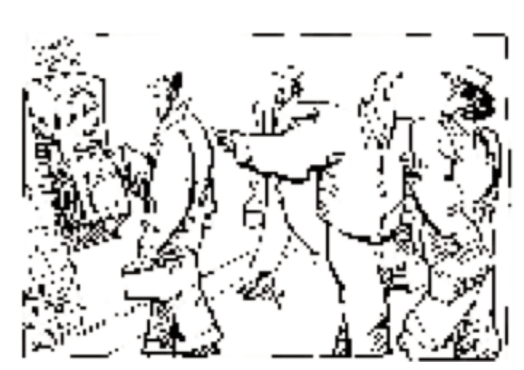
"It's on corporate standard time ... It loses an hour of your pay every day."

The truth is, with a union, you have a right to negotiate a contract that is legal and binding and indeed does guarantee you the wages and benefits you deserve. Try asking your employer to sign a contract or guarantee your rights, wages and benefits!