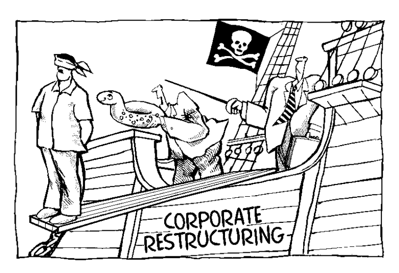
"Our apologies. We forgot your severance package."

Many of the employers who hire Local 399 members contribute to a pension plan per the contracted agreement. Over the course of a career as a Local 399 member, pension contributions can accumulate to a generous pension when you retire. Why wait until you're about to retire to realize that you and your family may have to live solely on Social Security, if it still exists. Anyone born after 1937 will not receive full benefits at age 65. Each year, the age to qualify will go up. What will it be 10 or 20 years down the road? If you've invested in the stock market, let's hope the economy is better than it is now when you're ready to retire. Even the experts can't predict what will happen with the stock market. You're at risk if you have a company retirement plan. Companies go bankrupt and aren't able to fund their pension programs. If you have a 401k plan, you should be aware that many companies have reduced their participation into these programs.