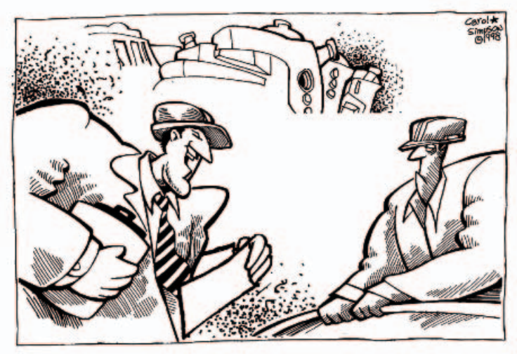
"Everyone makes mistakes, Hargrove ... That's why we have termination procedures!"

It is illegal to terminate an employee for joining a union. It is your right under the law to seek union representation.